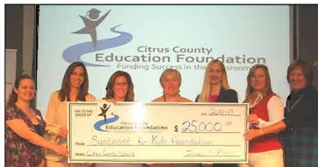
Foundation board members & partners at the Mini-Grant presentation, College of Florida (Lecanto).