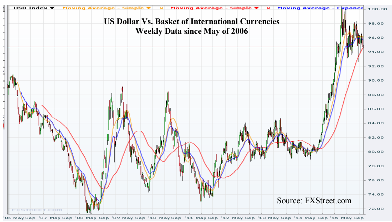
The US Dollar had a 25% rise from July of 2014 to March of 2015. Since then, it has backed off about 5.1%. That means that key International currencies have risen relative to the US Dollar which has helped the recent value of their bond markets. The chart pattern since March looks like a pendent which

Last week generated Double Green lights in the International Bond market securities that are not Hedged to the US Dollar including the Emerging Market bond sector. The Green lights reflect the action that bond yields are going down in these sectors which increases the price of the related bonds in the open market. First let's look at the action of the US Dollar Performance Vs. a Basket of international currencies (Euro, Yen, Pound, Canadian Dollar, Swiss Franc, and Swedish Krona) shown in the chart below: