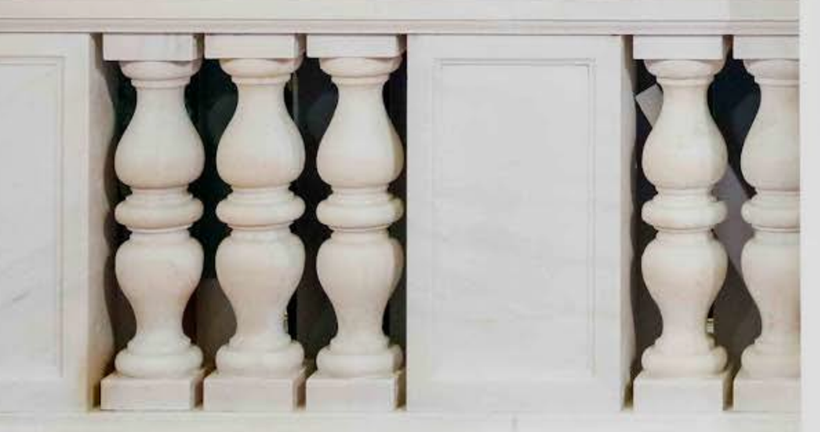
60TH YEAR ANNIVERSARY OF