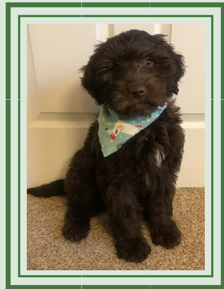
Murphy Peterson, Goldendoodle