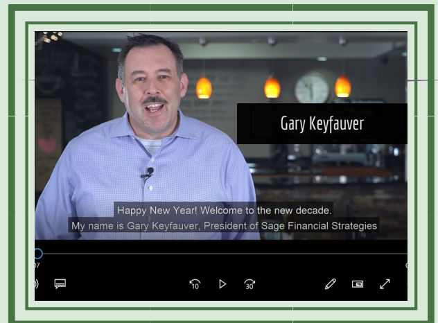
1st Quarter Market Update Video