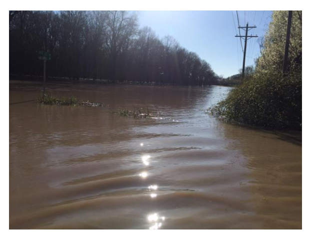
Lee Drive in Clarksdale connects to my street, Oak Knoll, and was flooded for a week.