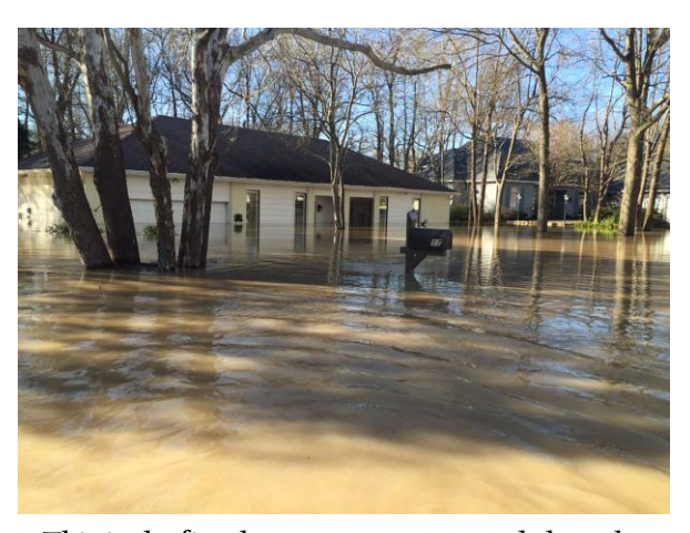
This is the first home on my street and the only one flooded.