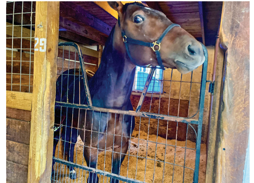
Bear says "Here's looking at you, kid"