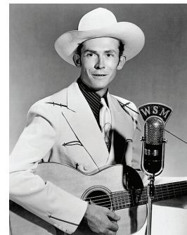
Hank Williams, Sr.