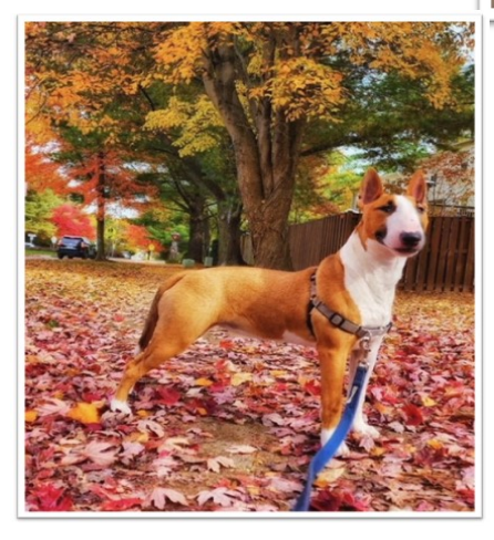
Lane's grand-dog Rosie striking a pose for the camera.