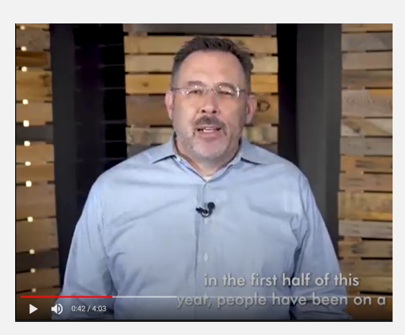
Click here for the 4-minute video