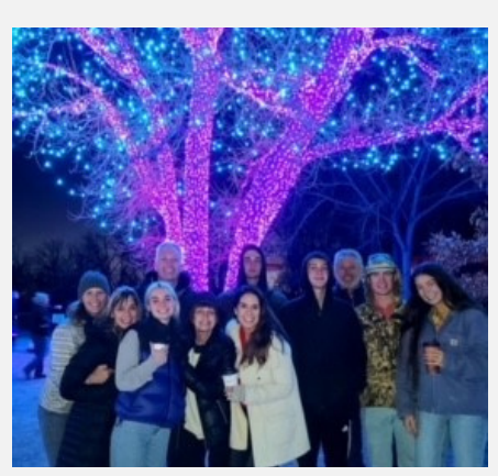
Petersons at Hudson Gardens with family