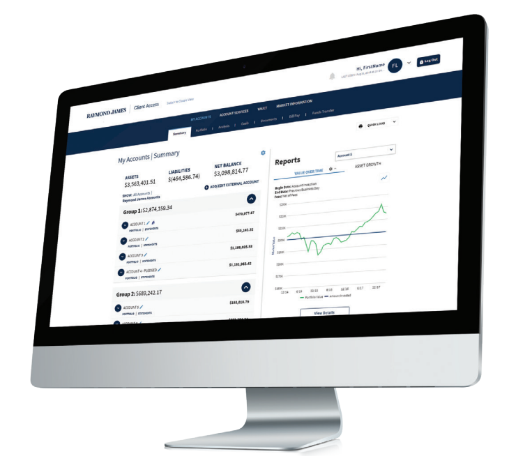
Client Access site

Mobile Access – The Client Access mobile app is available on Apple and Android. The app allows for secure access to Raymond James and external account data, the Vault and advisor information. It also offers mobile check deposit capabilities.