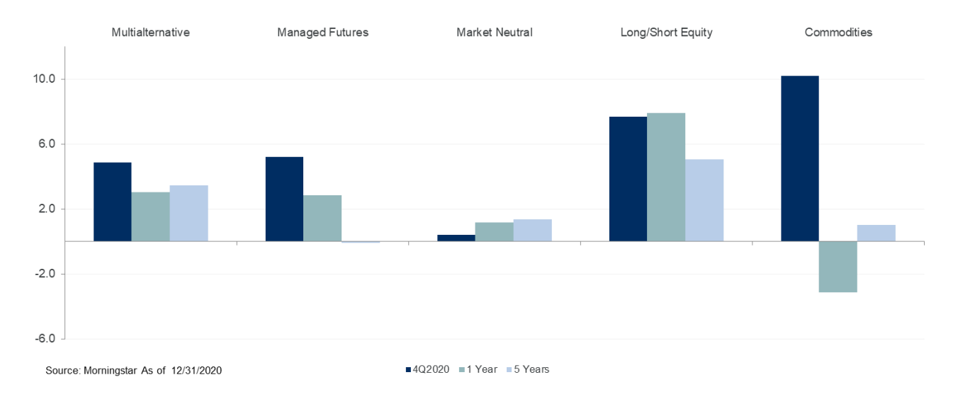
Page 4 of 6