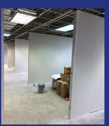
Walls are up in the New Orleans office!

The new Mandeville office is in the home stretch!