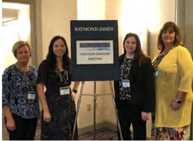
Louisiana Operations Managers attended the 2019 Operation Managers Conference in Tampa, FL on October 23-25