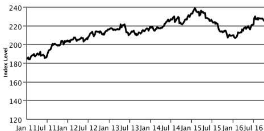
Hypothetical Back-Tested and Historical Performance of the J.P. Morgan ETF Efficiente® DS 5 Index

The hypothetical back-tested and historical closing levels of the Index should not be taken as an indication of future performance, and no assurance can be given as to the closing level of the Index on the Observation Date. We cannot give you assurance that the performance of the Index will result in a payment at maturity in excess of your principal amount.