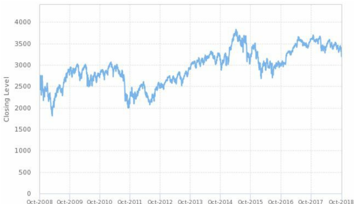
Historical Performance of the EURO STOXX 50® Index

The graph below shows the daily historical closing levels of the underlier from October 19, 2008 through October 19, 2018. We obtained the closing levels in the graph below from Bloomberg Financial Services, without independent verification.