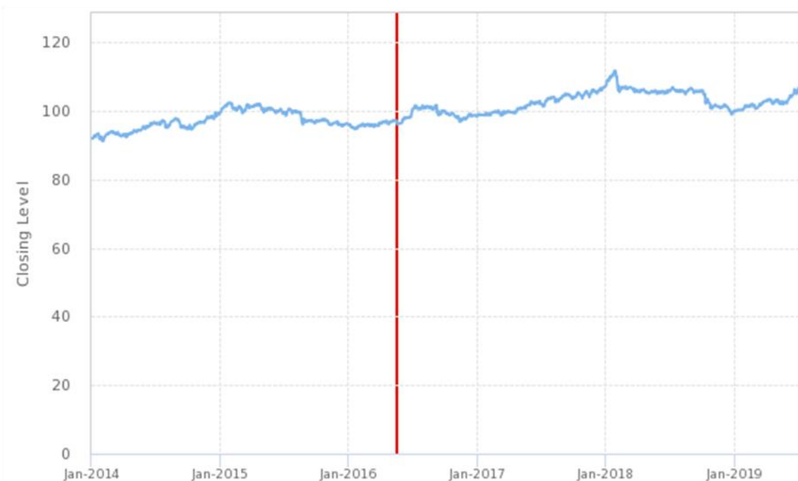
Historical Performance of the GS Momentum Builder® Multi Asset 5S ER Index

The hypothetical performance data from January 1, 2014 to May 15, 2016 is based on the historical levels of the eligible underlying assets using the same methodology that is used to calculate the index. The hypothetical performance data prior to the launch of the index on May 16, 2016 refers to simulated performance data created by applying the index's calculation methodology to historical levels of the underlying assets that comprise the index. Such simulated performance data has been produced by the retroactive application of a back-tested methodology, and may reflect a bias towards underlying assets or related indices that have performed well in the past. No future performance of the index can be predicted based on the simulated performance described herein. You should not take the hypothetical performance data as an indication of the future performance of the index.