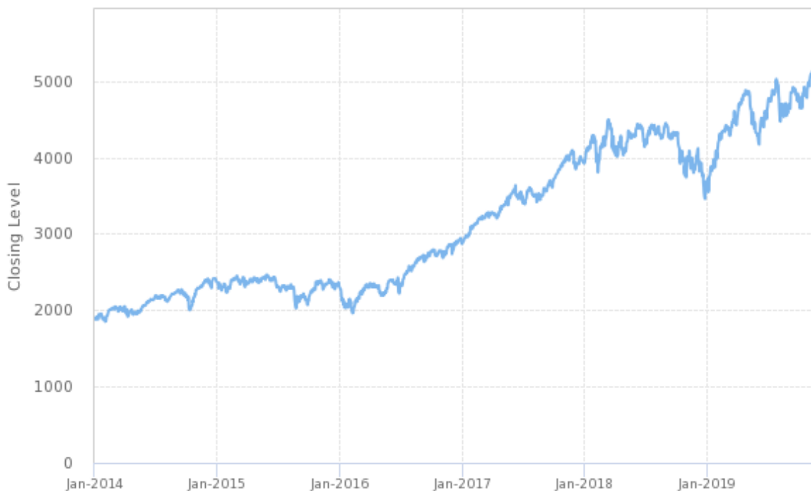
Historical Performance of the NASDAQ-100 Technology Sector Index

The graph below shows the daily historical closing levels of the underlier from January 1, 2014 through November 22, 2019. As a result, the following graph does not reflect the global financial crisis which began in 2008, which had a materially negative impact on the price of most equity securities and, as a result, the level of most equity indices. We obtained the closing levels in the graph below from Bloomberg Financial Services, without independent verification.