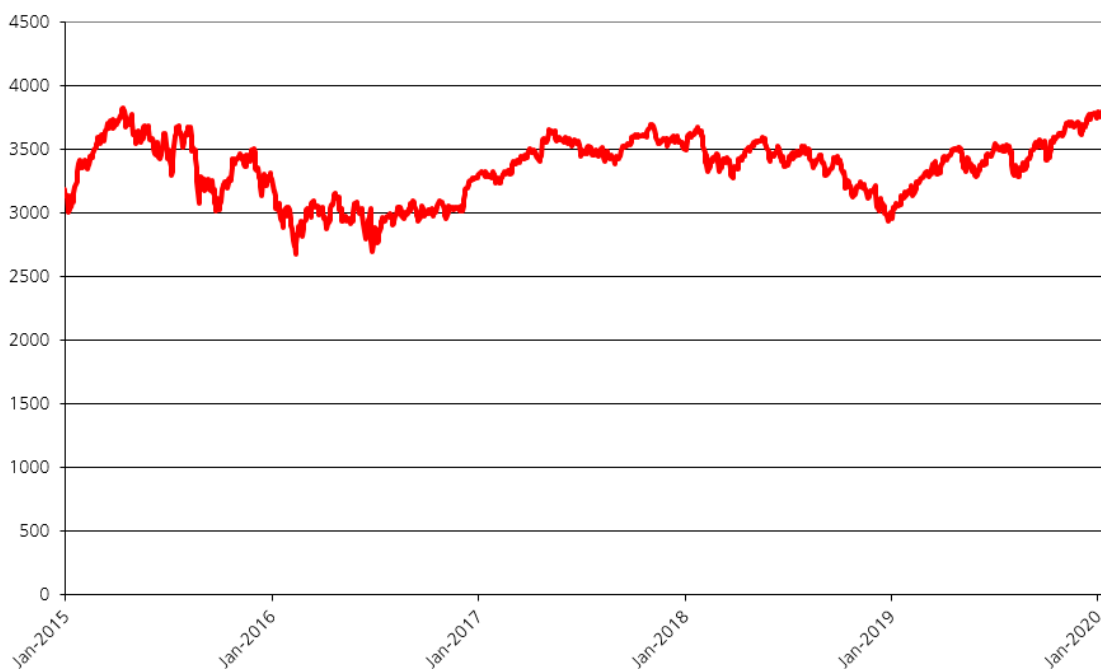
Historical Performance of the EURO STOXX 50® Index

We have not undertaken an independent review or due diligence of the information. The historical performance of the reference asset should not be taken as an indication of its future performance, and no assurance can be given as to the final level of the reference asset. We cannot give you assurance that the performance of the reference asset will result in any positive return on your initial investment. Past performance of the reference asset is not indicative of the future performance of the reference asset.