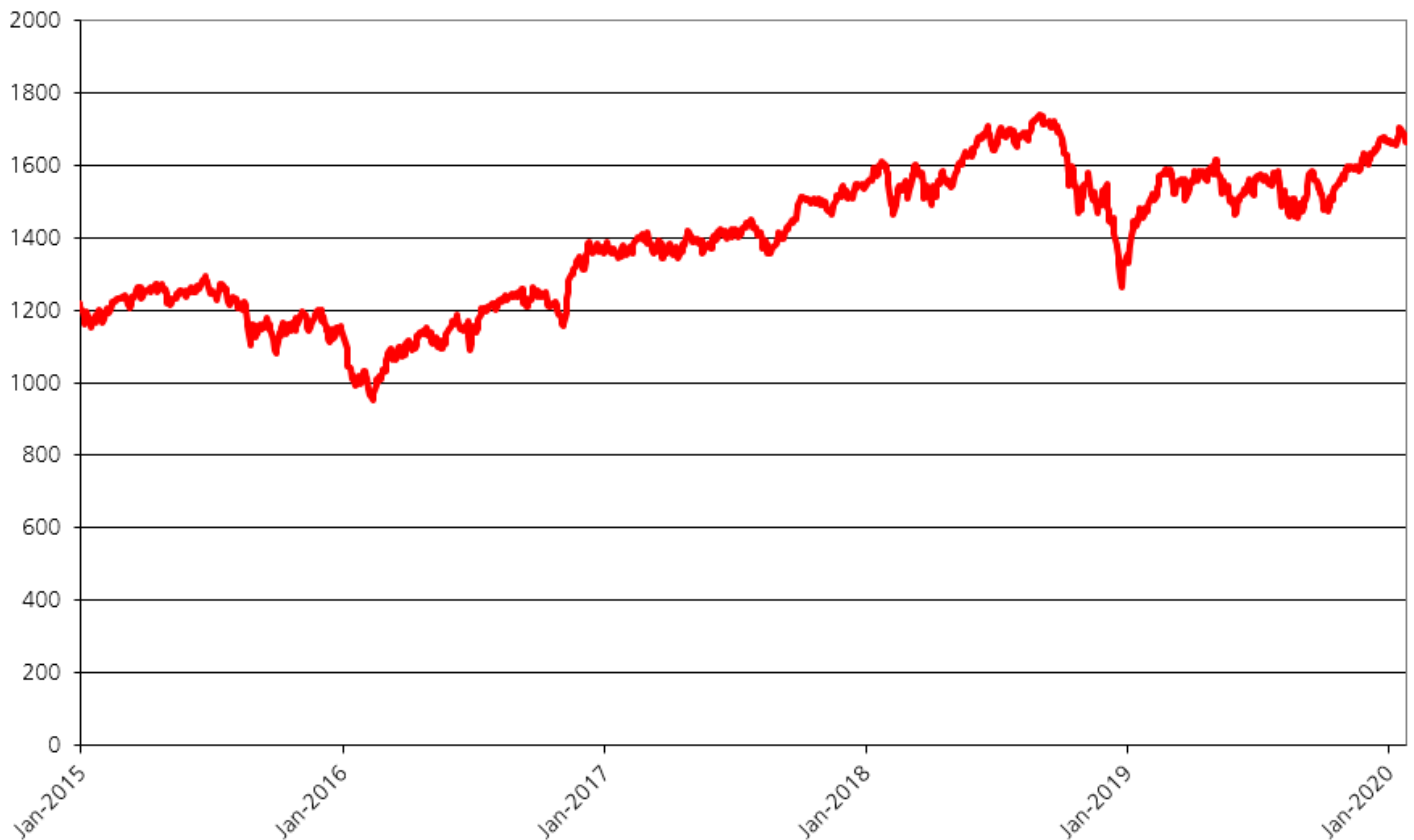
Historical Performance of the Russell 2000® Index

We have not undertaken an independent review or due diligence of the information. The historical performance of the reference asset should not be taken as an indication of its future performance, and no assurance can be given as to the final level of the reference asset. We cannot give you assurance that the performance of the reference asset will result in any positive return on your initial investment. Past performance of the reference asset is not indicative of the future performance of the reference asset.