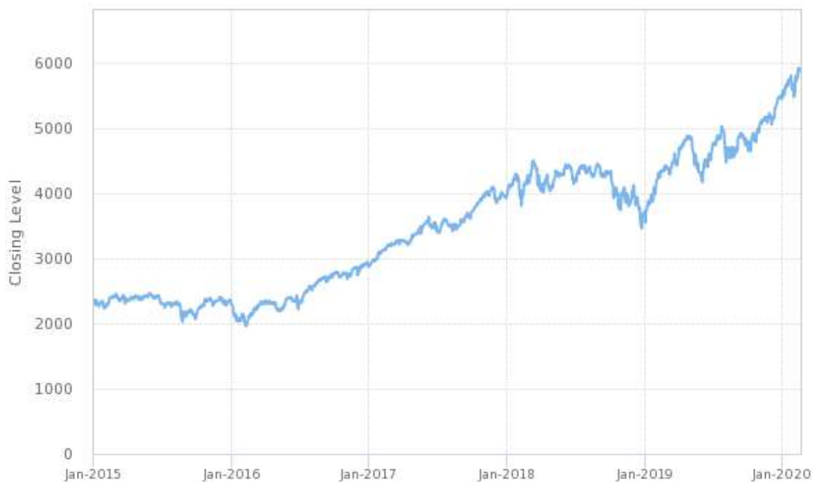
Historical Performance of the NASDAQ-100 Technology Sector Index

The graph below shows the daily historical closing levels of the underlier from January 1, 2015 through February 21, 2020. As a result, the following graph does not reflect the global financial crisis which began in 2008, which had a materially negative impact on the price of most equity securities and, as a result, the level of most equity indices. We obtained the closing levels in the graph below from Bloomberg Financial Services, without independent verification.